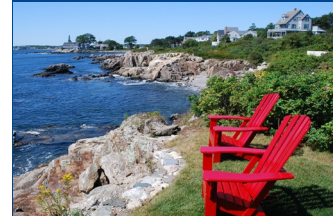
Explore quaint Kennebunkport