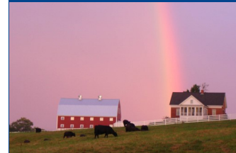
Visit the picturesque Pineland Farms