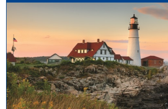
See the Portland Head Lighthouse